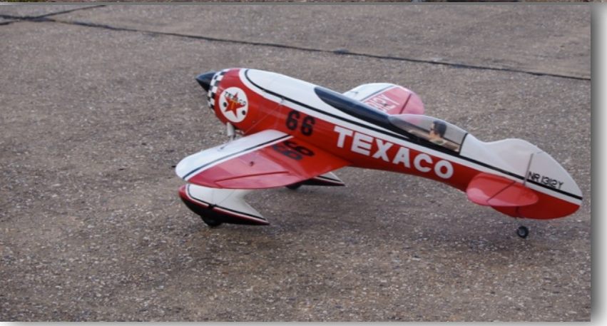
Wot! Nobody bothered to contribute to CD

I had zero response from this request posted on last months CD, which means either nobody reads this or nobody has a tale to tell.