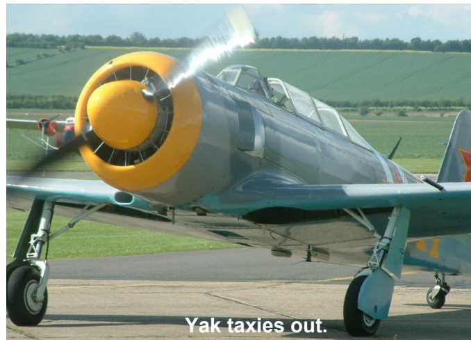
Yak taxis out.