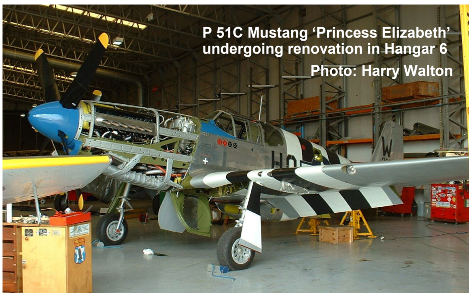
P 51C Mustang 'Princess Elizabeth' undergoing renovation in Hangar 6