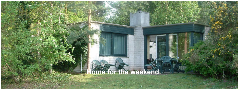
Home for the weekend.