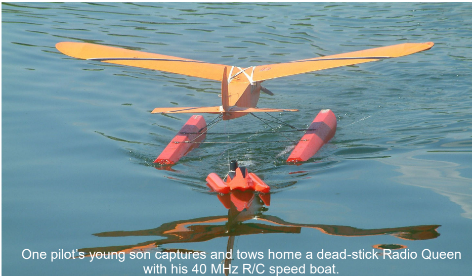
One pilot's young son captures and tows home a dead-stick Radio Queen with his 40 MHz R/C speed boat.

Sunday dawned flat calm and very sunny so it was off to the flying site. The sun and calm conditions had brought out more flyers and it looked like it was going to be an action packed day. We assembled our models, handed our transmitters into the control tent and watched some of the diverse types of models that were flying and crashing. Whoever said that hitting water is softer than hitting the ground, wants