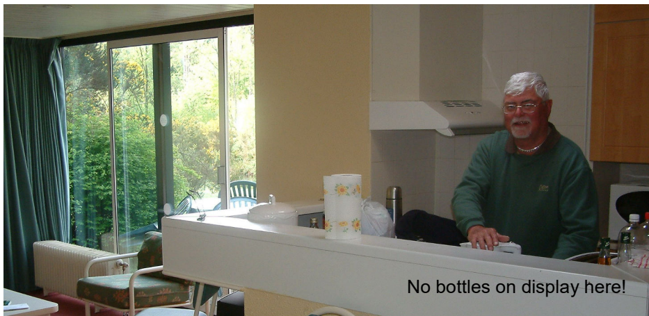
No bottles on display here!

The weekend arrived and it saw Terry B, The Claridge Gang, Bruce and myself driving up to Nottingham on the Friday lunchtime. Bruce and I arrived at Centre Parcs five hours later, booked in and went to meet the others. When we were all installed, we all went out to eat although I must admit the dining area in our suite was better stocked than most off licences I have been in.