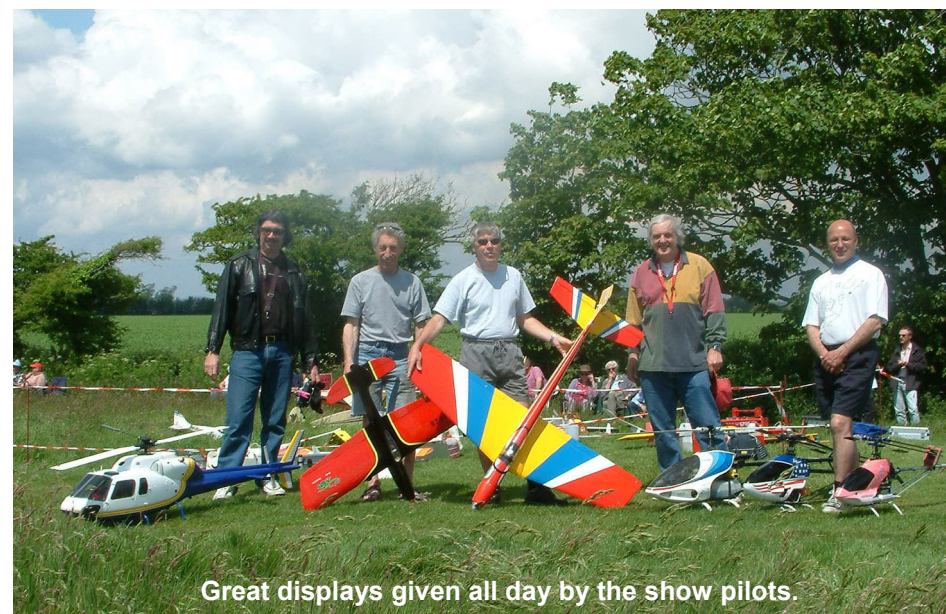
Great displays given all day by the show pilots.

sation (including Sea Vixen fly-past) that rumour has it Trevor Bowry has been approached to try and 'turn round' the Sandown Symposium next year!!! Ed.