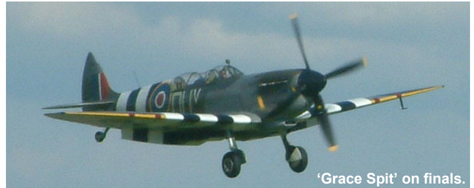
'Grace Spit' on finals.

whole display. Having de-bussed I think most of us followed the same pattern for the day, working our way up the roadway via the hangers on the right hand side and back down via the trade stands on the left before lunch, and then settling down to watch the flying in the afternoon. Staged reenactments of RAF Briefings from WW2, swing bands and air raid