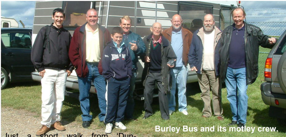
Burley Bus and its motley crew.