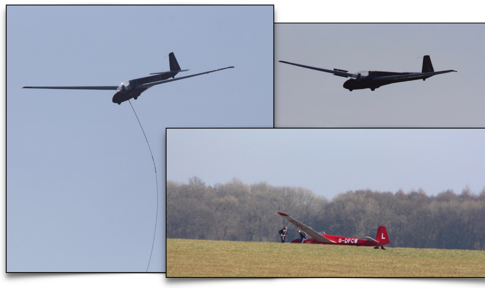
Seen at Lasham earlier this year, looks like a tow line failure whether this was an exercise or not I am not sure