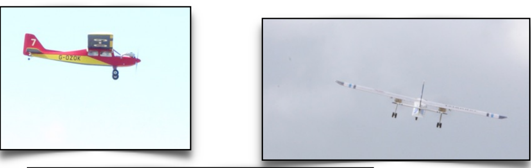
Clear Dope - April 2005